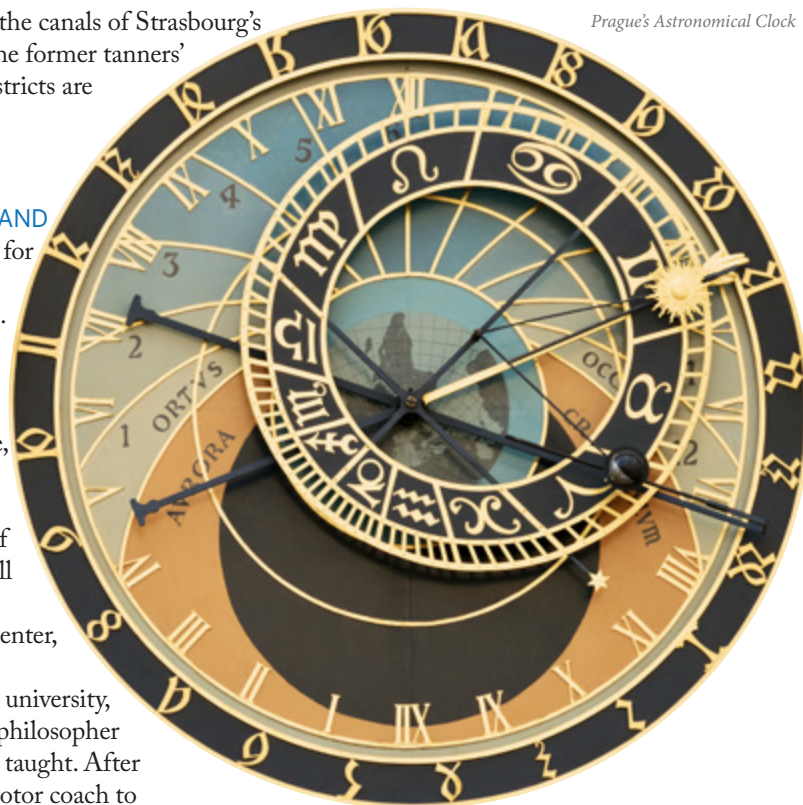
Prague's Astronomical Clock

Mönch and Jungfrau peaks. This evening enjoy a special farewell dinner.